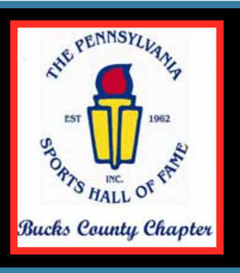
Bucks County Chapter Class of 2016